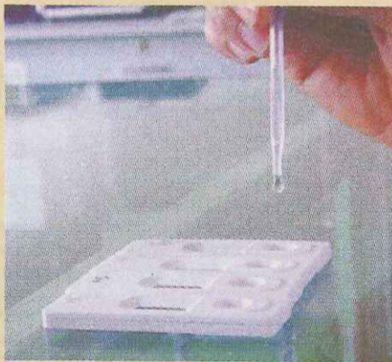
Experts and patients have raised concerns over lack of a national guideline on oral HIV testing.

Providing Access to Healthcare (Ampath) in partnership with the Moi Teaching and Referral Hospital.